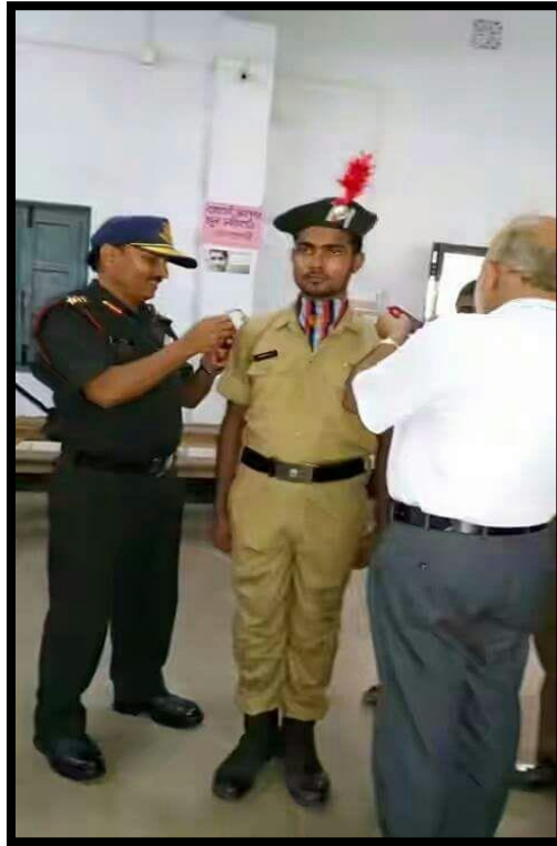
SELECTION OF SENIOR UNDER OFFICER 18.10.2016