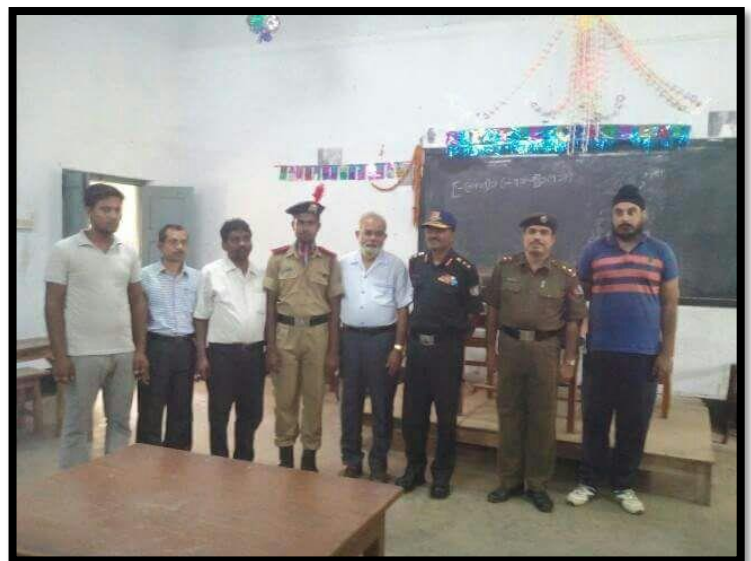
FIRST VISIT BY CO ON 08.08.2016